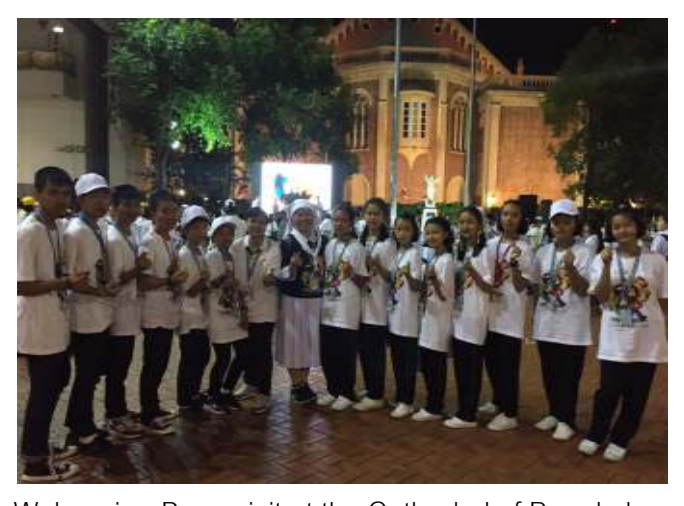
Welcoming Pope visit at the Cathedral of Bangkok