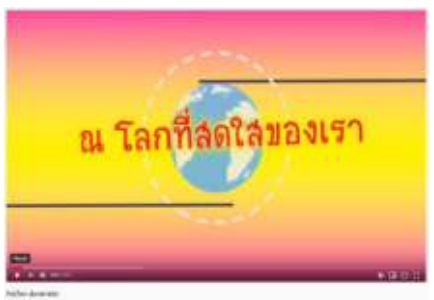
"Save the World, Stop Plastic" Malasawanphittaya School