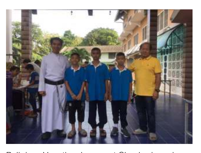
Religious Vocational camp at Chonburi province