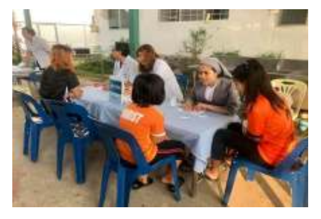
Mobile Medical Unit, St. Louis Hospital Providing free basic check-up and medicines.