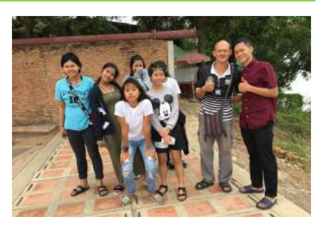
Training about family and family's problem