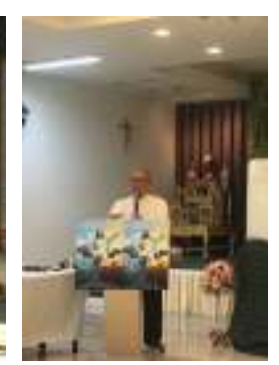
Lent Seminar on 29 – 31 January 2020