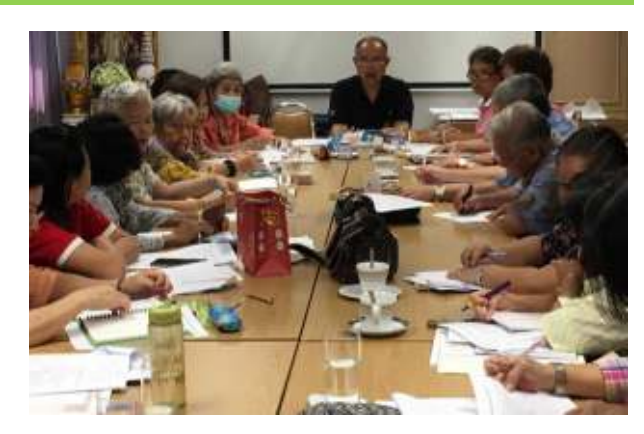
7 Feb 19