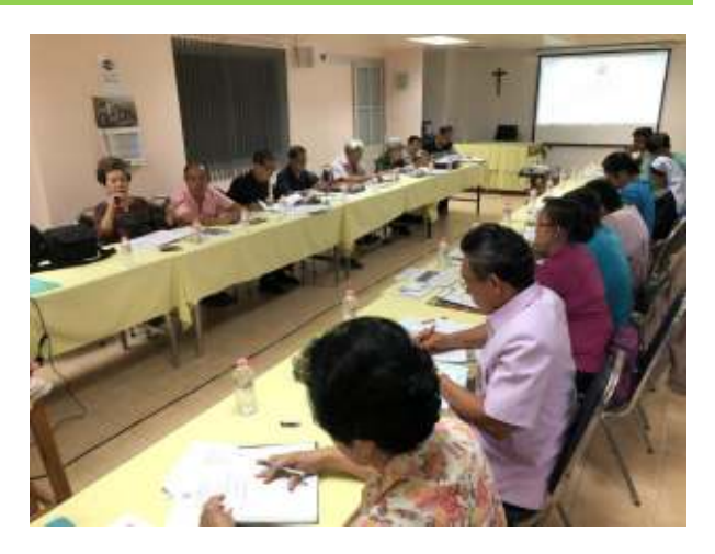
20 Mar 19 Arrange a meeting at Camillian Home for Children Living with Disabilities