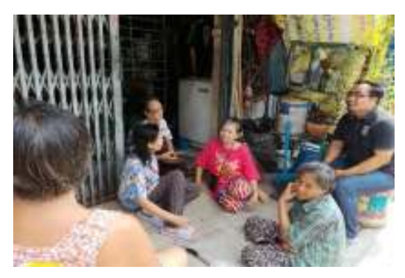
Underprivileged and elder people who got survival bags from "Boon Tor Boon" visiting