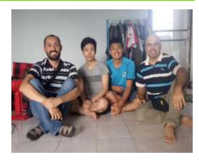
Visiting ethnic groups who work in the factory