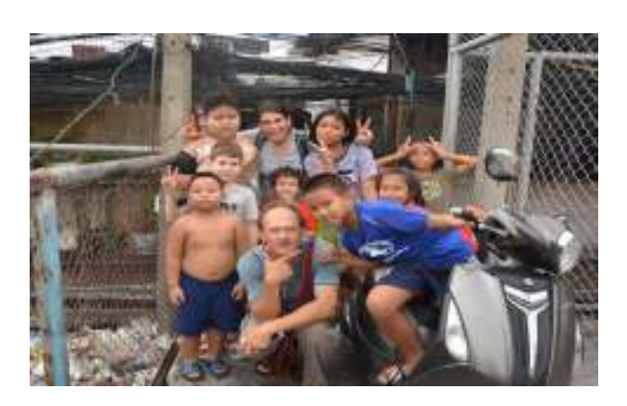
Visit the elderly, the sick, and children in the communities