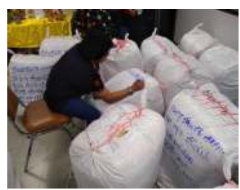
16 December 2019 officers packed survival bags for small villages and small communities in the Northern and Northeastern of Thailand