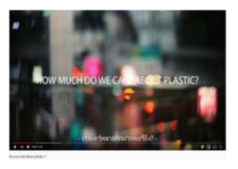
"Do you care about plastic?" Saint Dominic School