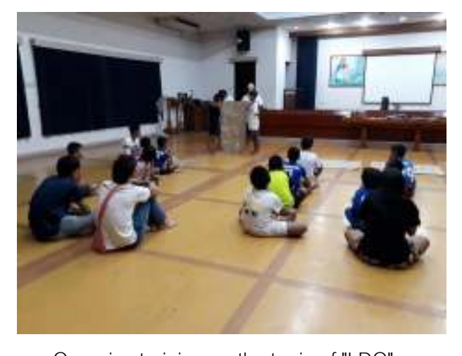
Organize training on the topic of "I DO"