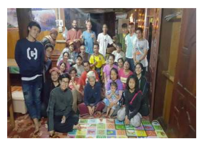
Visit a Catholic family in Tak Province