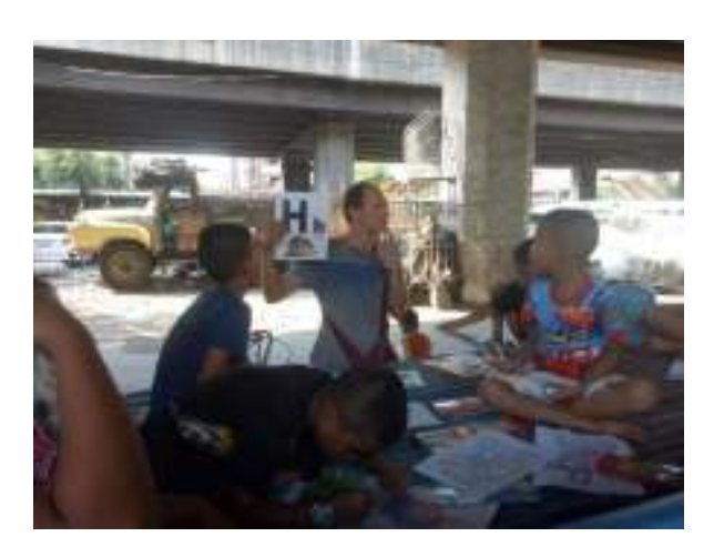
Teach English vocabulary