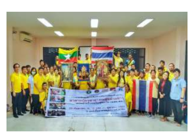
Samutsakhon Hospital and Mahidol University organize public health training.