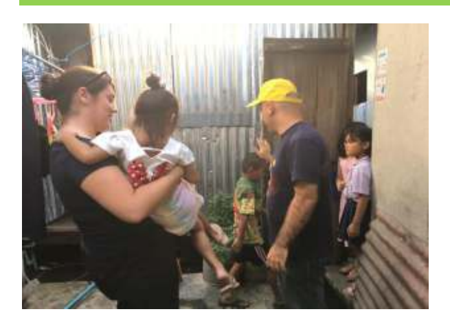
Visit the communities of Hua Khong, Rom Klao, Cheua Plerng Pat Ta Naa, Lok, and 70 Rai.