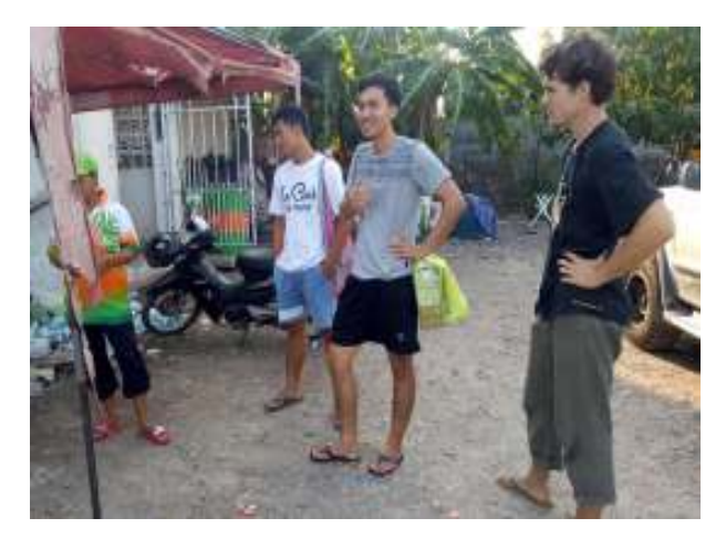
Visit the ethnic groups who work In Samut Sakhon province