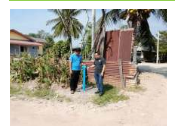
Learning about Groundwater Bank at Ban Klong, Lopburi