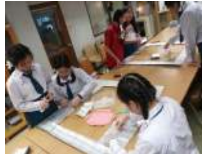
Saint Joseph Convent School representative student joined the social activity on 31 November 2019