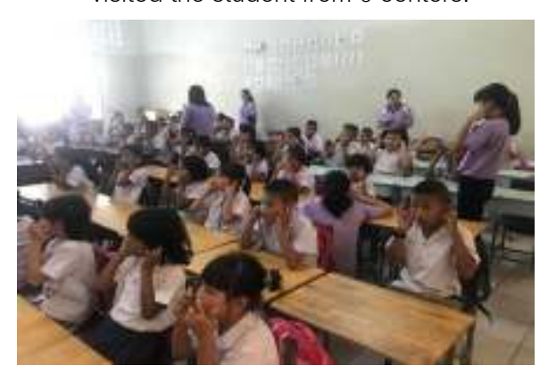
Bansomdejchaopraya Rajabhat University organize educational activities such as Thai manners, Thai children games, and teaching the Thai language.