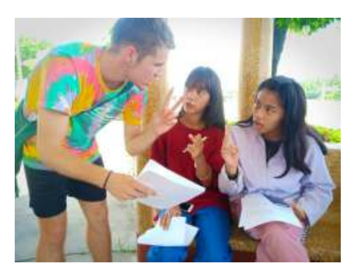
Teach about volunteer missionary life