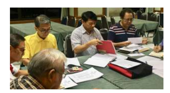
23 May 19