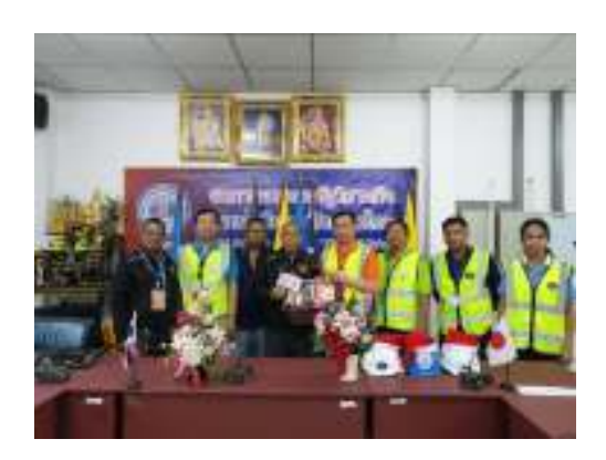
Christmas greeting for the crews