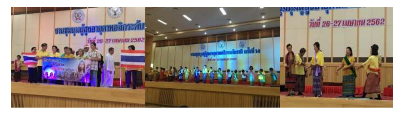
27 Apr 19 14<sup>th</sup> National catholic elderly congregation.