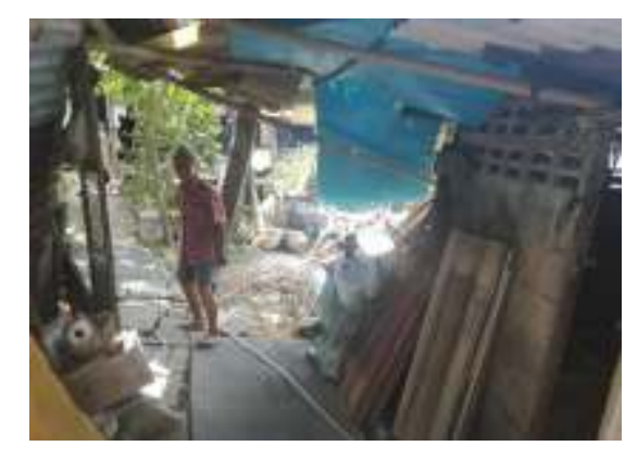
Visiting the poor who have surveyed