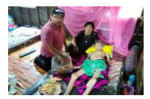
Visiting the bedridden patients and gave survival bags.