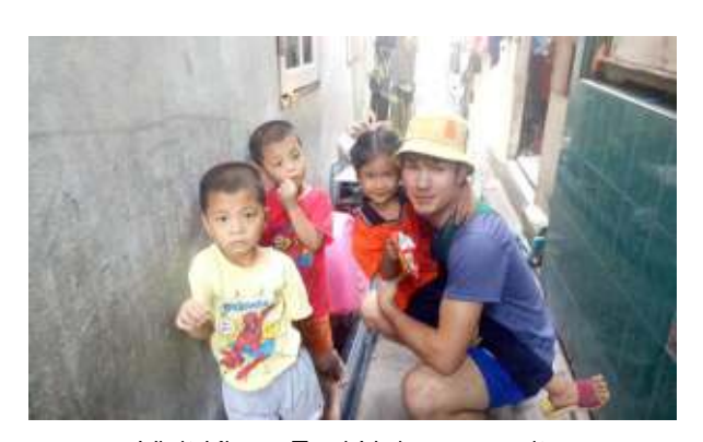
Visit Klong Toei Nai community