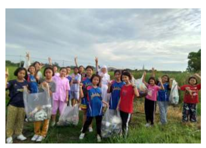
Big cleaning around the parish of St. Roch