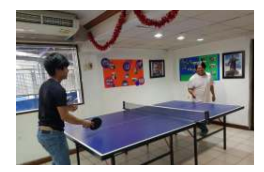
The crews use the official service at the center