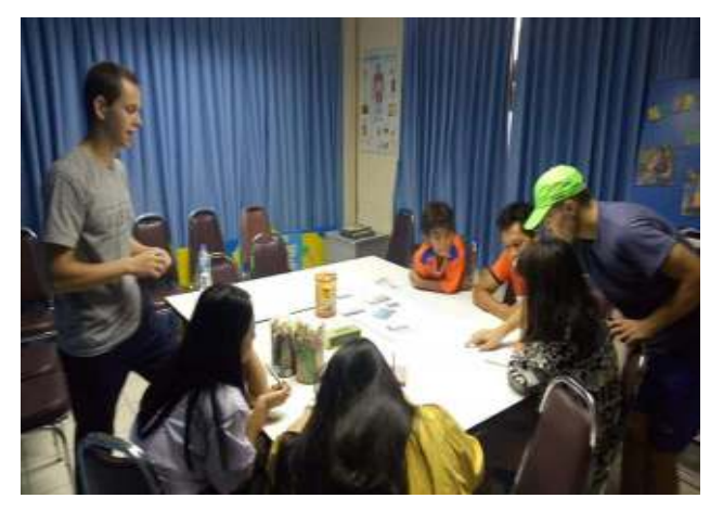
Teach English in the topic of "Things around us"