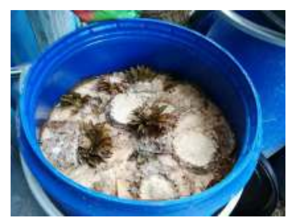
Following up the overall result of the bio-fertilizer group