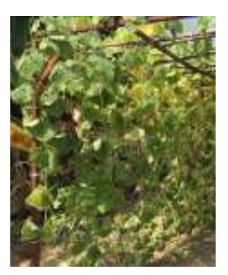
YSF Project progress at Saint Joseph Upatham Nongree School