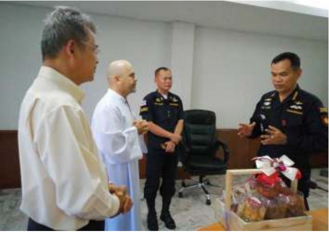
Greeting Representative Director of Central Correctional Institution for Young Offenders, gave 120 sets of presents, 140 sets of food to inmates, organized activities to send happiness on Christmas and New Year's Eve occasion.