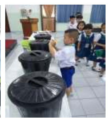
Maephraprachak School, Bangkok