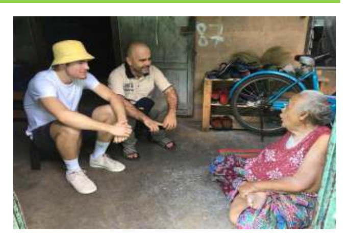
Visit the communities of Rohng-moo, 70 Rai, and Flat 23-25