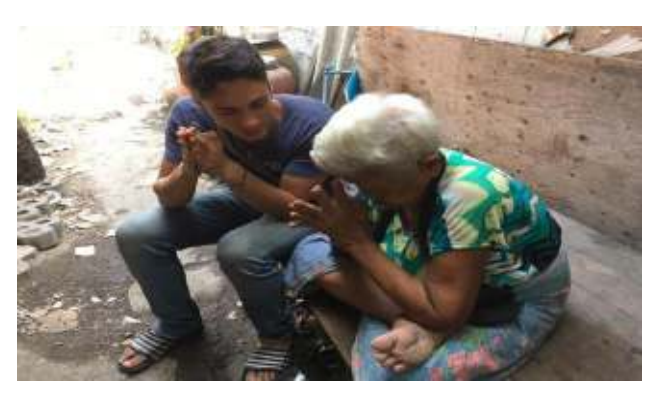
Visit the communities of Rim-tang-Rot-Fai-Sai Ta Reua, and Rohng-moo