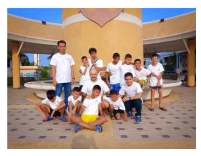
Organize a camp at the St. Ann Church, Cha Thin