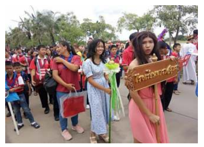
Joined the Youth Games of Bangkok Archdiocese