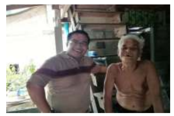
Following up and visiting the bedridden patient who got the hospital bed from us