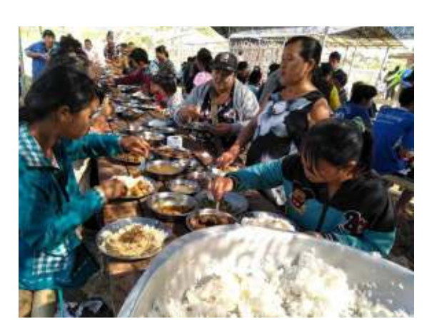
Christmas party for children at Myanmar Asylum