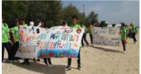
Beach garbage collection at Cha-Am Beach